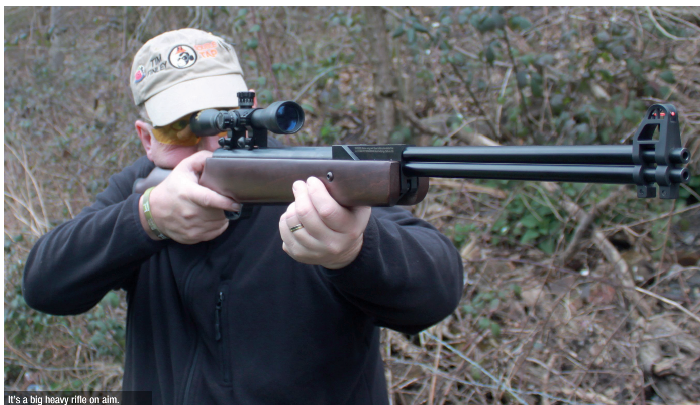
It's a big heavy rifle on aim.

It has a 120mm long 11mm scope rail machined into the top of the cylindrical action, and at the rear of this is an arrestor block. »