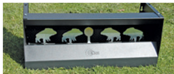
The 'Knockdown Target' is the largest SMK magnetic box design