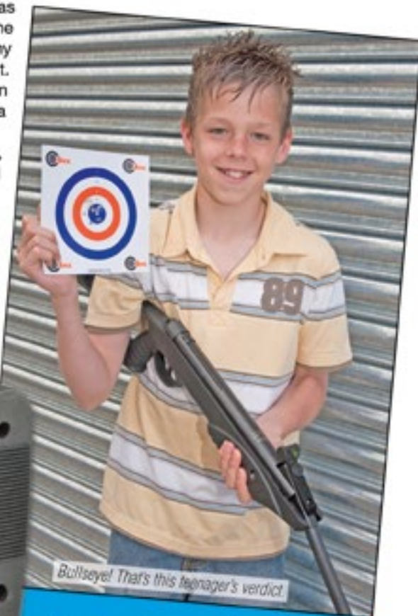
Bullseye! That's this teenager's verdict.