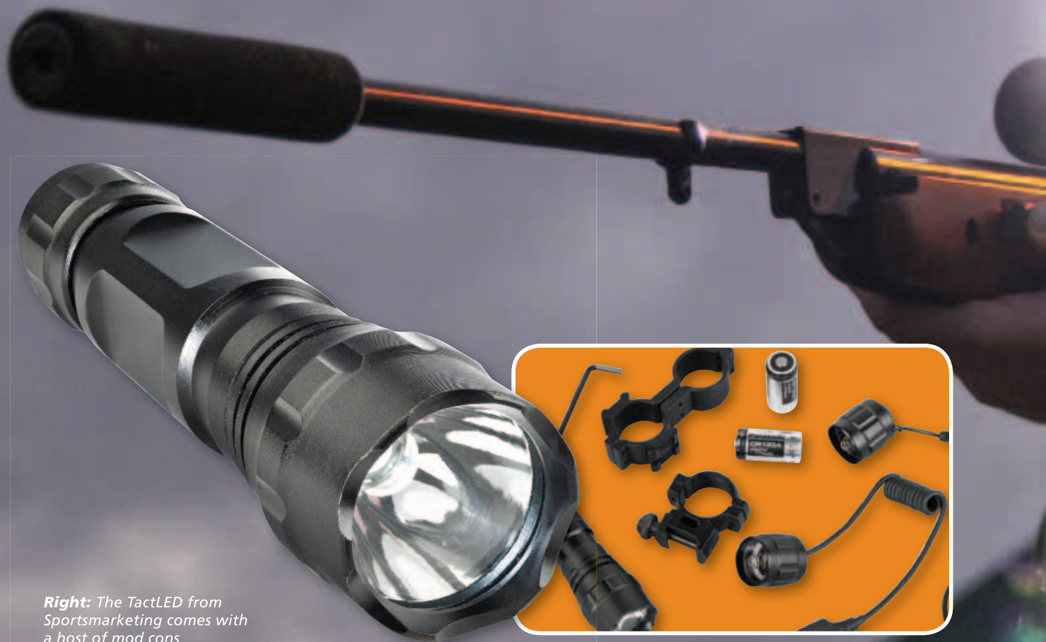
Right: The TactLED from Sportsmarketing comes with a host of mod cons

Professional pest controller Pete Meek updates his lamping gear to a more fashionable set-up, courtesy of the TactLED flashlight from SMK