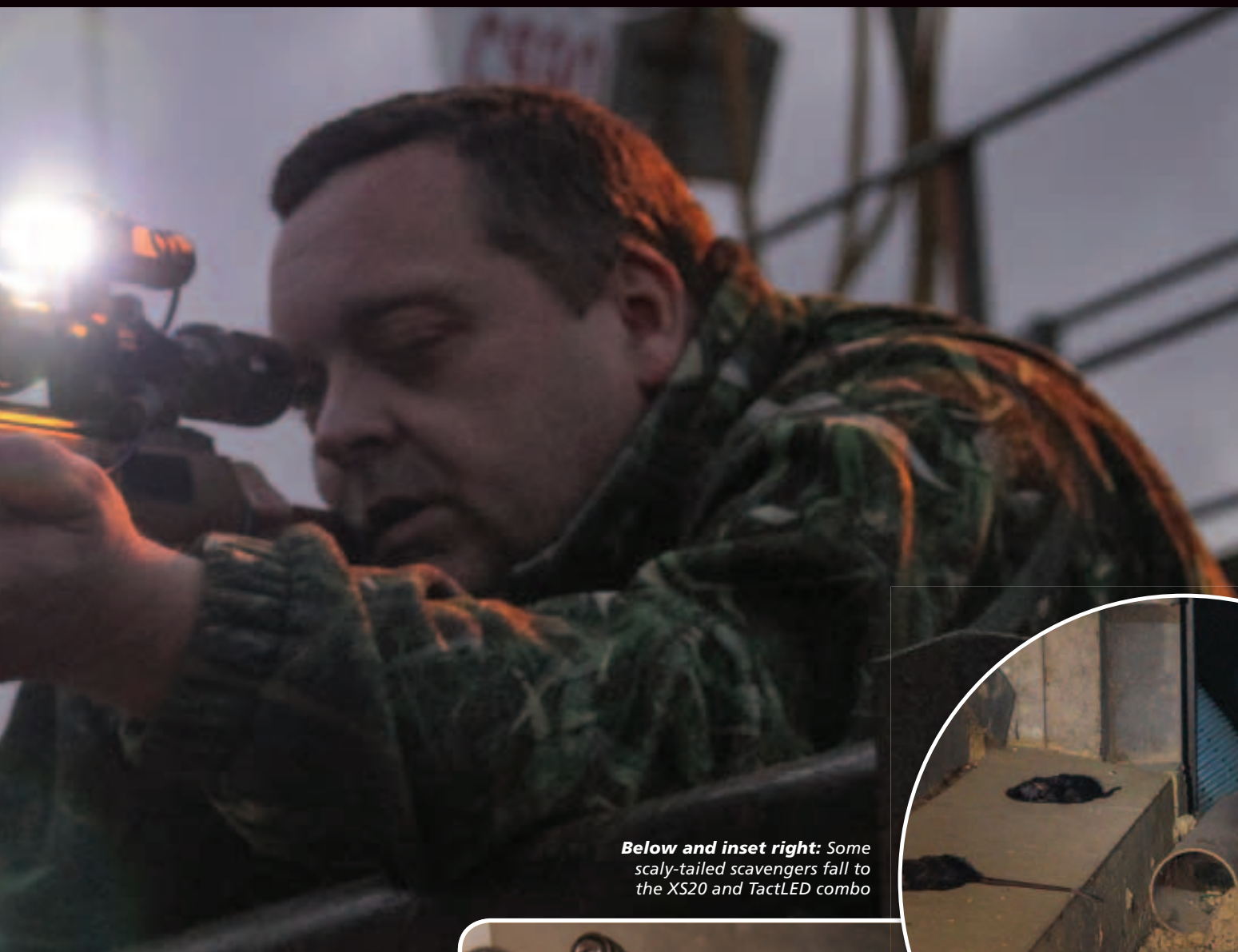
Below and inset right: Some scaly-tailed scavengers fall to the XS20 and TactLED combo