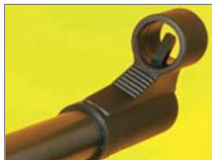
The Supergrade XS19 sports hooded foresight... ...and a fully-adjustable rearsight.

Scope grooves are also provided, so both sighting options are covered, making the Sportsmarketing Super Grade XS19 a 'best of both worlds' rifle – and that tag applies in more ways than one!